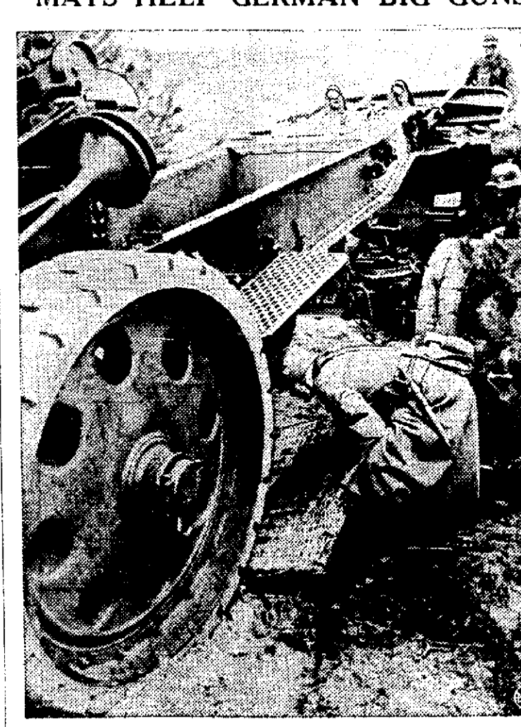
According to Nazi-censored caption this photo shows heavy German artillery temporarily slowed on the way to the Western Front battle. Troops are using mats to keep the big wheels from sinking into the soft ground.

There are more than 13,665 square miles of national parks in the United States—a territory larger than the total area of Belgium or the Netherlands.