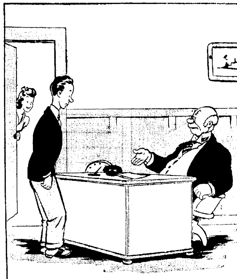
"So you want to marry my daughter! Very interesting—tell me how she overcame your sales resistance?"