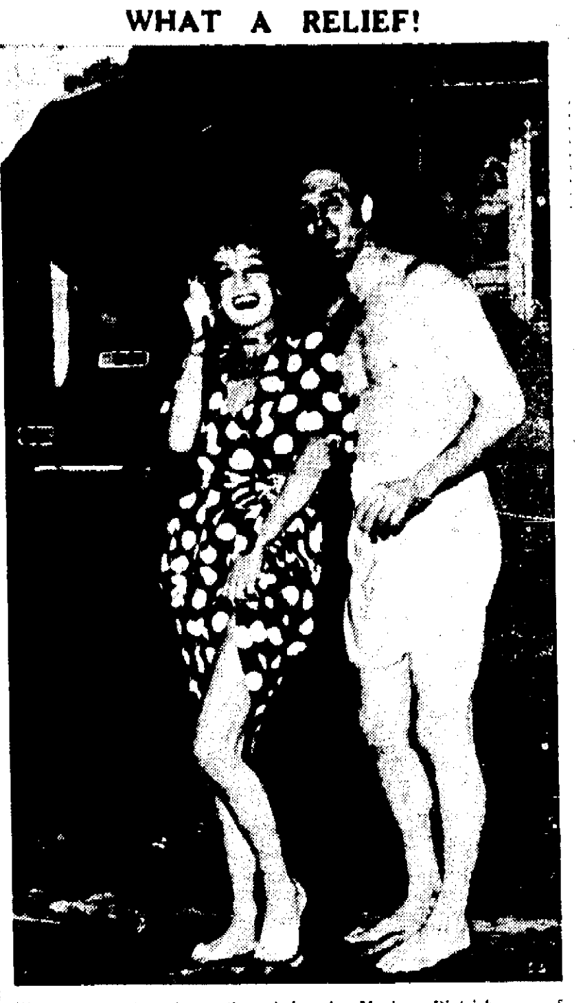
Glamour was tossed out the window by Marlene Dietrich, one of Hollywood's better known possessors of that quality, when a brief but furious rainstorm occurred in the midst of more than 100-degree heat at the studio where she is making a comeback.

All of the latter have appeared repeatedly on this series. The spirit of gaiety and frivolity associated with American Legion conventions will be captured by Ired Skelton and the cast of the Avalon Time program when they perform before a capacity audience of Legionnaires in the Auditorium theatre, Chicago, Saturday.