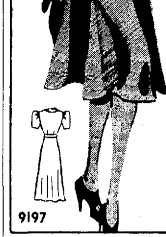
PATTERN 9197 Boleros bloom prominently in the fall and winter fashion scene. And Marian Martin's attractive pattern 9197 will make you a perfect "little suit" to wear all round the clock.

The American Association play-off to determine which of the four leading teams will represent the league in the "Little World Series" with the International League playoff winner was off to an up-setting start today.