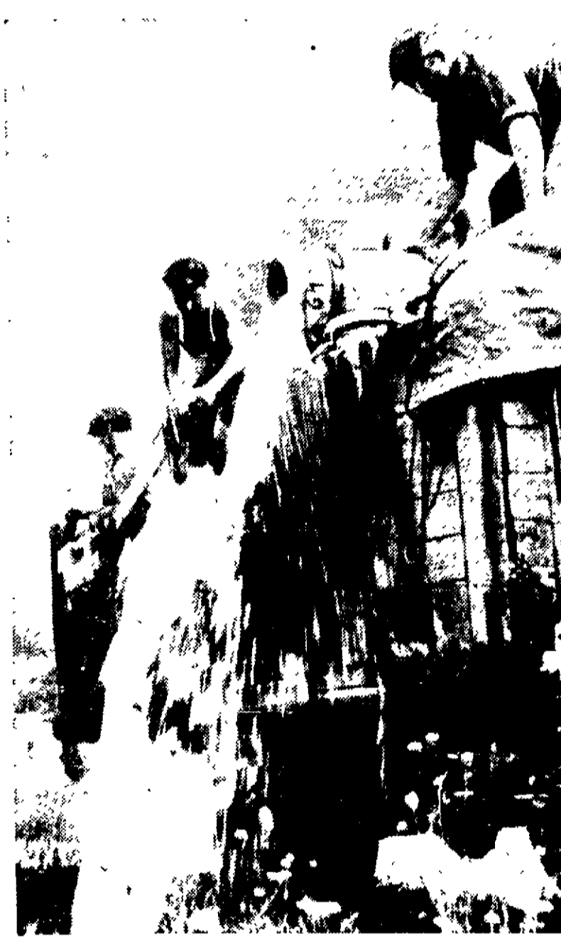
Striking dairy farmers dumped this milk near Buskirk, N. Y., as the New York Dairy Farmer union pushed its boycott against the New York City market in an attempt to boost prices.