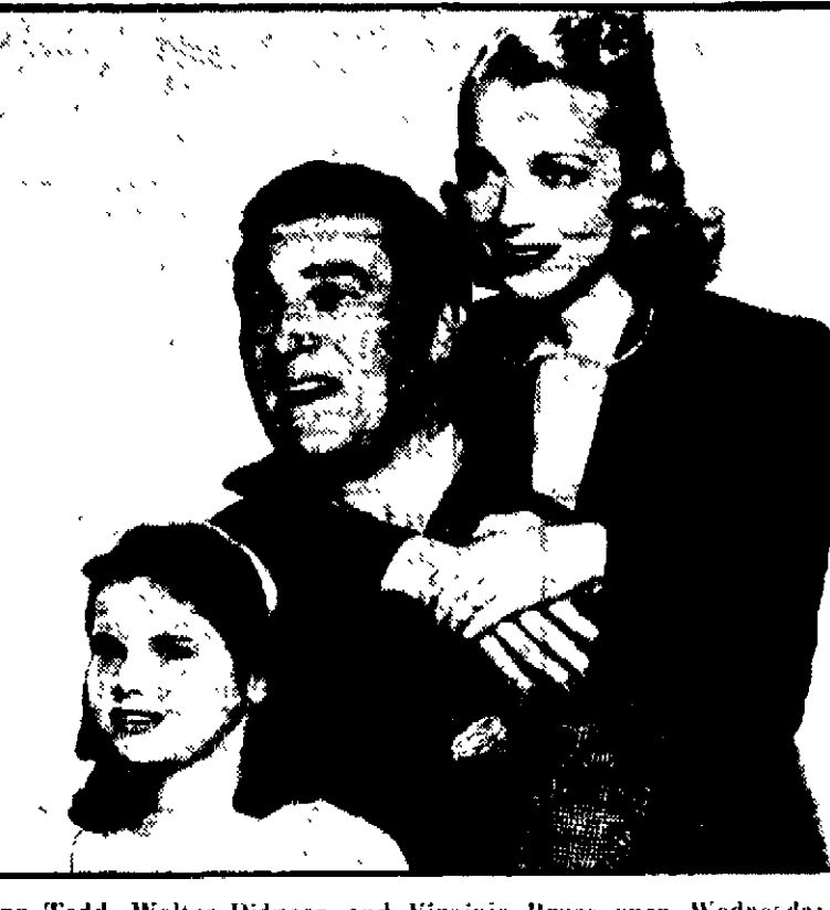
Ann Todd, Walter Pidgeon and Virginia Bruce open Wednesday at the Ohio in "Stronger Than Desire."