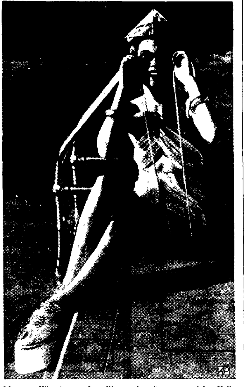
Of course, Film Actress Jane Wyman doesn't recommend her Hollywood get-up for actual swimming but it can be worn for sun-bathing alongside a quiet pool in movie land. Note the bubbly beads, the large glass buttons on the cork-platformed shoes and the transparent helmet.