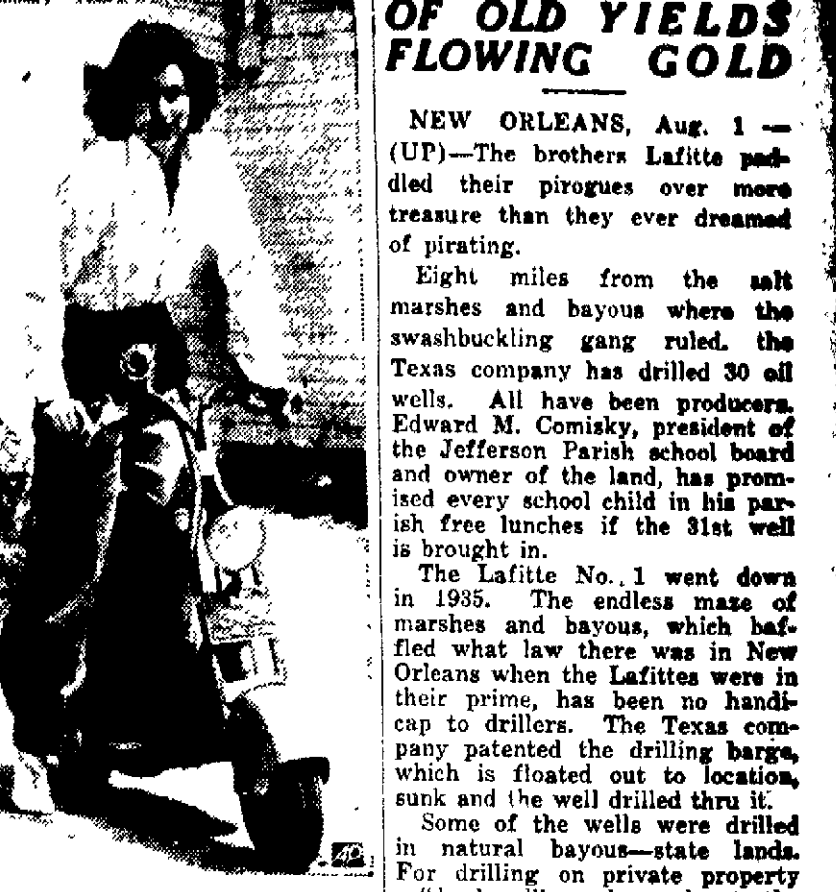
Hope she'll be the fifth of Barrymores to land on Broadway inspires Diana Barrymore (the above), now at Ogunquit, Me. theatre. Her father's John Barrymore.

sets to work in his usual fascinating fashion to solve the crime.