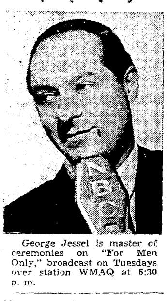
George Jessel is master of ceremonies on "For Men Only," broadcast on Tuesdays over station WMAQ at 6:30 p. m.