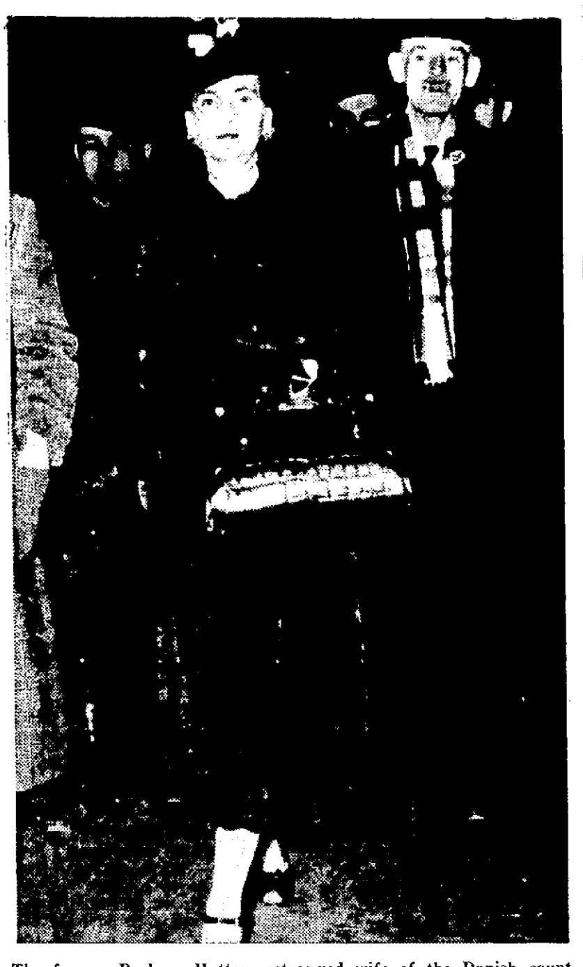
The former Barbara Hutton, estranged wife of the Danish count, Kurt Haugwitz-Reventlow is shown as she came ashore in New York from the liner Aquitania "for a brief visit in the United States with my son, Lance, in order to see my father and friends."