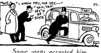
Some wags accosted him