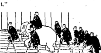
On an elephant and stills

Six nights a week he's in bed by 10. . . . He has 23 college degrees. . . . To tourists he seems the incarnation of Jove or Jehovah. . . .