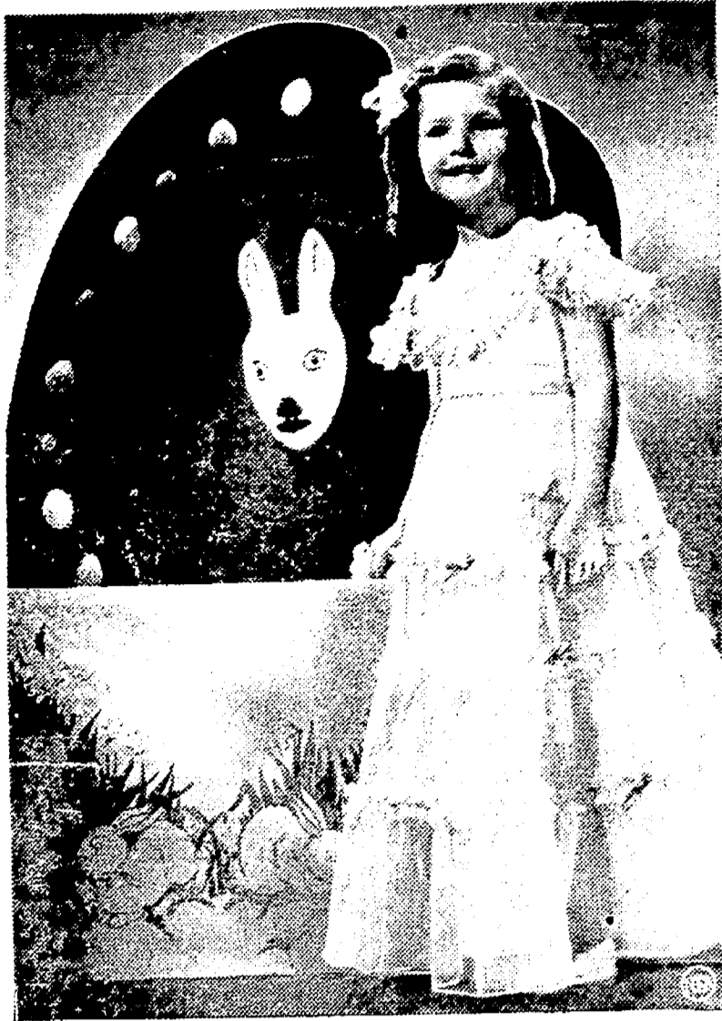
For a party during Easter holidays a fragile, feminine, curly-headed child would be charming in this lovely, ankle-length frock of peach silk marquisette. The full skirt, with rows of self-ruching, is attached to a figure-hugging bodice with ruching trimming which suggests a shaped yoke.