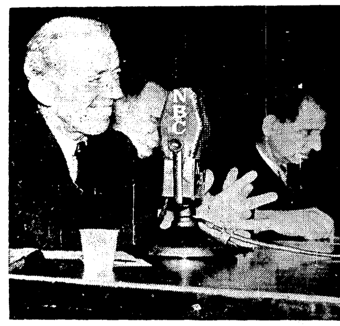
John Kieran and Franklin Pieme Adams The two "anchor men" on the Information Pleas's "board of experts"—John Kieran, left, and Franklin P. Adams, right—wait for another question. Dorothy Parker returns tonight as the extra "expert." Station WLS airs the program at 7:30 p. m. each Tuesday.