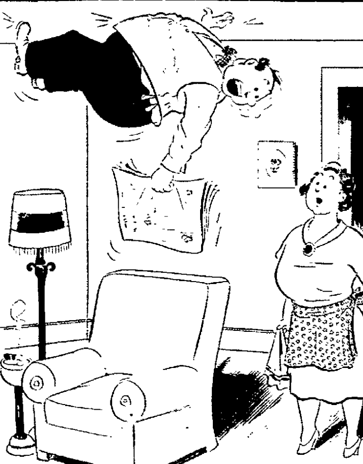
"Annie, bring me the bicarbonate, quick! It's that gas on my stomach again."

motorship Lutzen grounded on Orleans beach in dense fog.