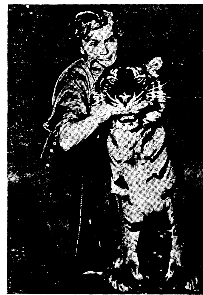
Mabel Stark, noted animal trainer and circus performer, is shown with one of her favorite tigers, about whom she will tell anecdotes during her appearance on Edgar Guest's "It Can Be Done" program tonight.