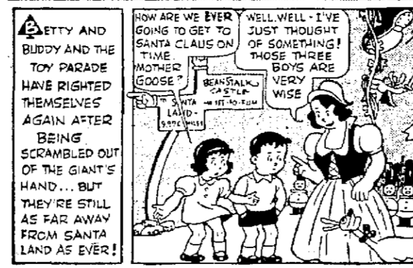
HOW ARE WE EVER GOING TO GET TO SANTA CLAUS ON TIME? MOTHER GOOSE!