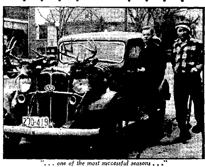
... one of the most successful seasons ...

League Meets Wednesday The Dane county sportsmen will hold a regular meeting Wednesday in the Superior court room of the Dane county court house at 8 p. m. Deer hunting will be discussed by state conservation officials.