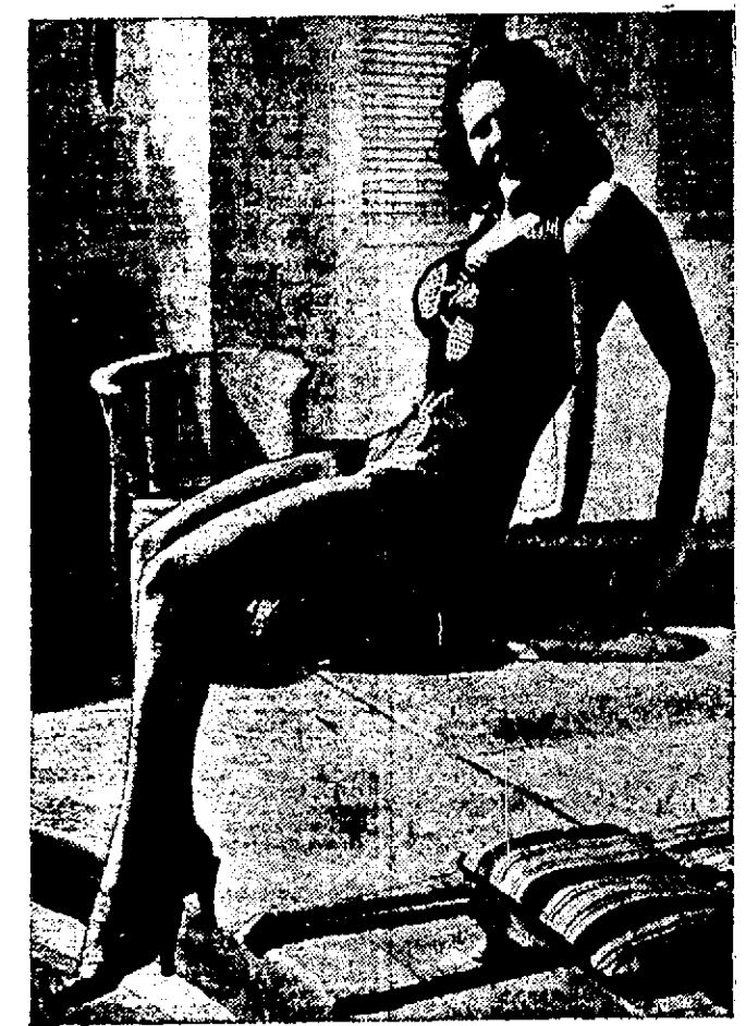
Martha Raye is the lady of song and laughter who adds her sunny disposition to the Al Jolson program heard over the Columbia network on Tuesdays at 8:30 p. m. The photographer has caught a fine sample of the Raye smile as Martha suns herself after a dip in the pool at her Hollywood home.

WIND ..... 880 WPMW-WLS #10 WMAQ ..... 880 WPMW-WLS #10 WISN ..... 880 WPMW-WLS #10 WISN ..... 880 WPMW-WLS #10 WISN ..... 880 WPMW-WLS #10 WISN ..... 880 WPMW-WLS #10 WISN ..... 880 WPMW-WLS #10 WISN ..... 880 WPMW-WLS #10