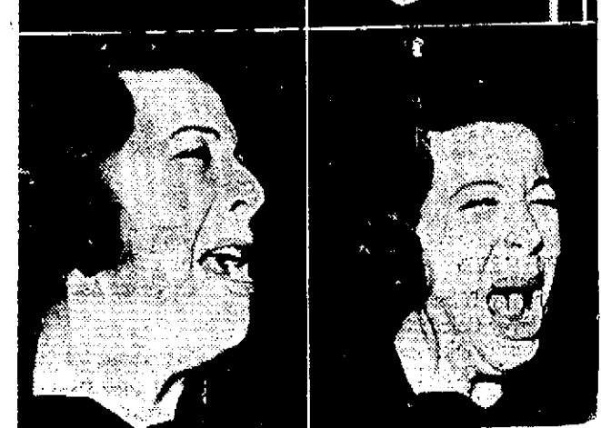
Baby Snooks, the fresh kid of NBC's Good News of 1938 program, has just about exhausted the patience of her "daddy". When these pictures were taken, Snooks had met with a sharp rebuff and is about to break down into a lusty "Wahhh." The four stages in the break-down are pictured.

WIND ..... 500 WENR-WLS ..... 870 WTMJ ..... 620 WHA ..... 940 WSM ..... 650 WGO ..... 1000 WCO ..... 810 WMAQ ..... 1070 WHAS ..... 820 WISN ..... 1120 WGN ..... 840 WJZ ..... 1210 WBWB ..... 740 WJLB ..... 1280 WLW ..... 770 WJAB ..... 1370 These programs are subject to change at discretion of stations.