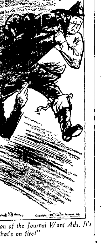
"On your way back bring me the section of the Journal Want Ads. It's my boarding house that's on fire!"