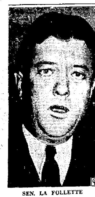
SEN. LA FOLLETTE