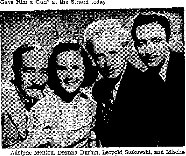
Auer in "100 Men and a Girl" at the Orpheum