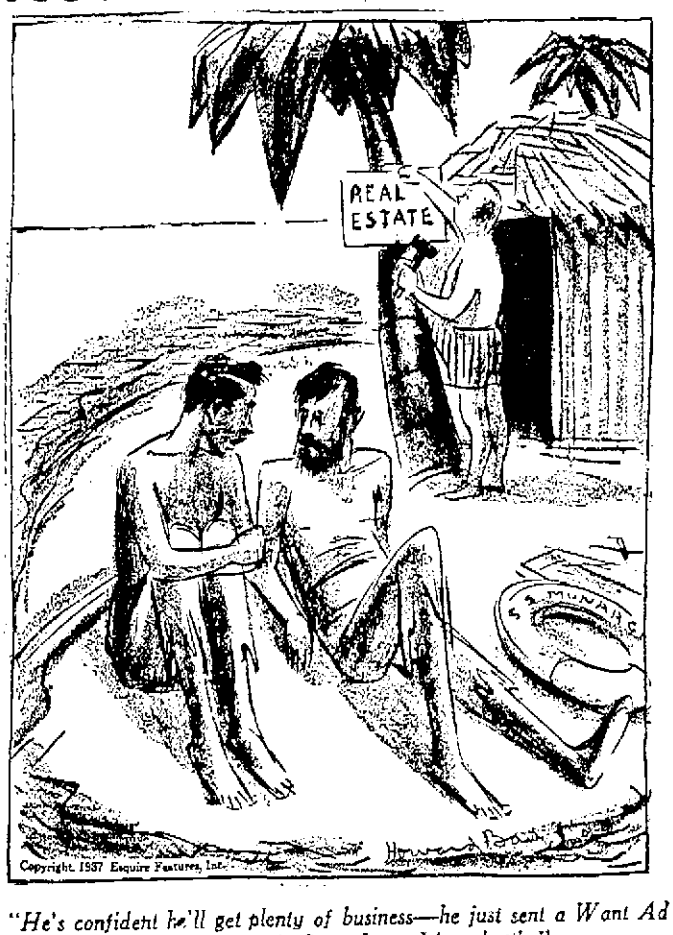
to The Wisconsin State Journal in a bottle."