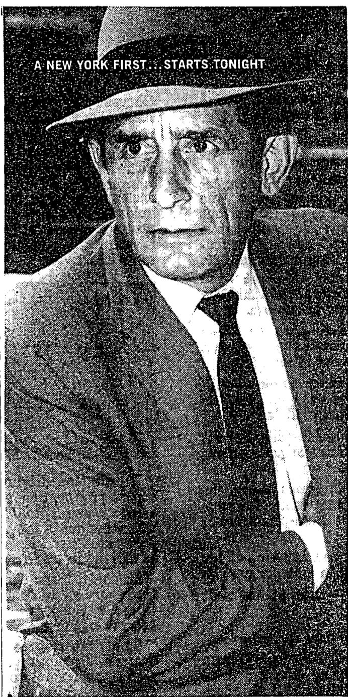
VICTOR JORY stars in