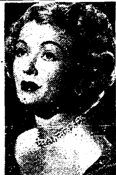
Constance Bennett will be heard on the Playhouse on Broadway at 7:30 p. m. tomorrow over WBBM.