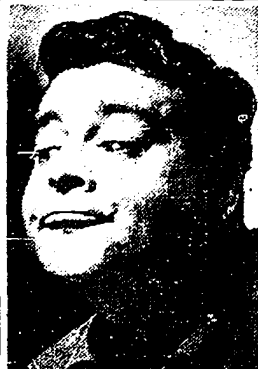
Jackie Gleason begins his television series at 7 p. m. today over WBBM.