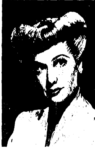
Miriam Hopkins, stage and screen star, will take the leading role in today's Inner Sanctum Mystery broadcast at 7:30 p. m. over WLS-Blue.