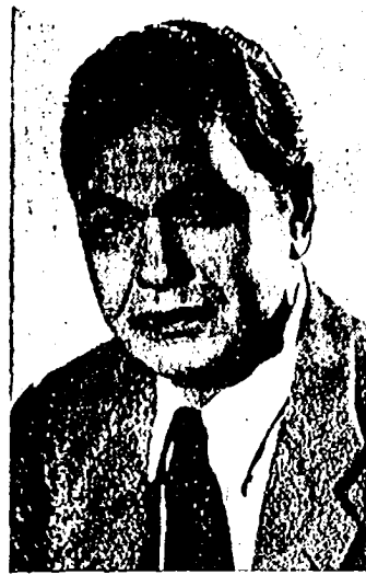
Edward G. Robinson of the screen, will narrate in the drama, "He Does Not Fly Alone," to be presented on W-G-N and Mutual from 2:30 to 3 p. m. today.