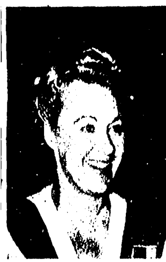
Grace Moore, soprano of the opera, screen, and concert stage, will make a guest appearance on Andre Kostelanetz program at 3:30 o'clock this afternoon over WBBM-CBS.