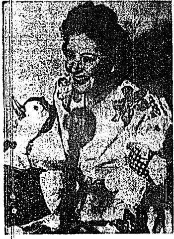
Gracie Allen substitutes her pet duck, Herman, for the Easter bunny. Gracie, George Burns and company continue their bewildering sessions over W-G-N at 9:30 p. m. Thursdays and over NBC Tuesday evenings.