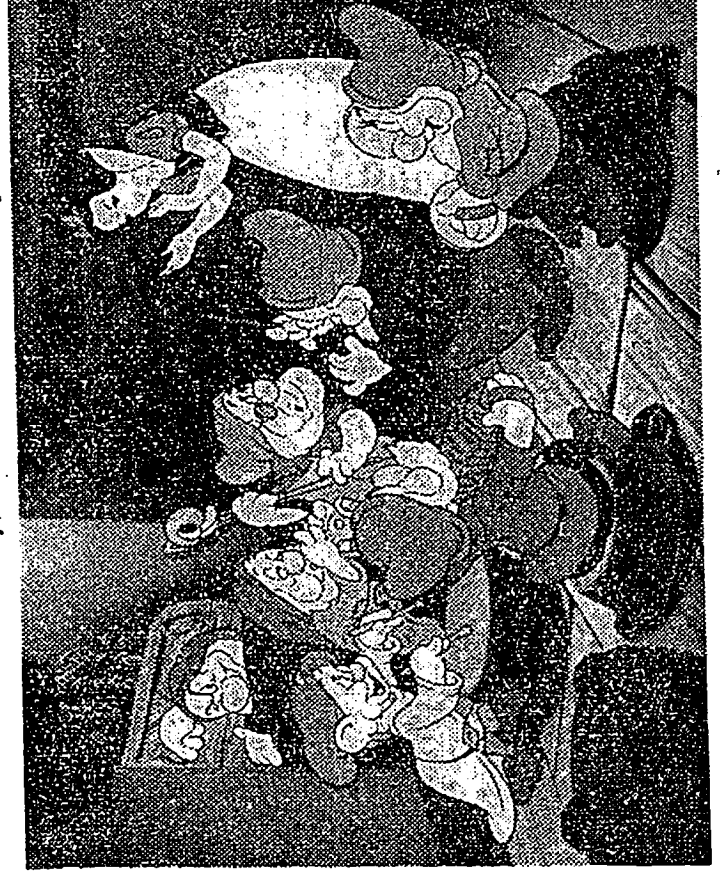
Sunday, December 23, 1951

Except from "Snow White and Seven Dwarfs" will be part of an hour-long Walt Disney Christmas Day (3 p. m.) program for children on WTOP. TV Disney will also present his 15-year-old daughter as one of 60 children participating in the non-cartoon part of the program.