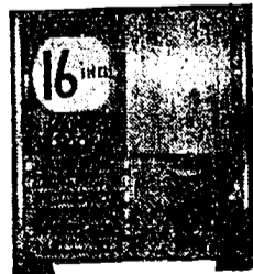
This was a 10" Philco Combination Which Sterling Converted to 16"